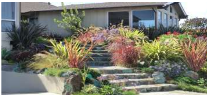
Sept 2012—The Baltimore-Howard Residence—112 Paseo de Suenos. Succulents and kangaroo paws border the curving stone path to the home's entry level.