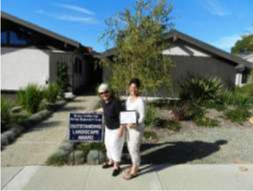
The Low Residence - 5213 Calle de Arboles