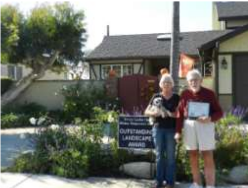
The Merritt residence - 621 Paseo de los Reyes