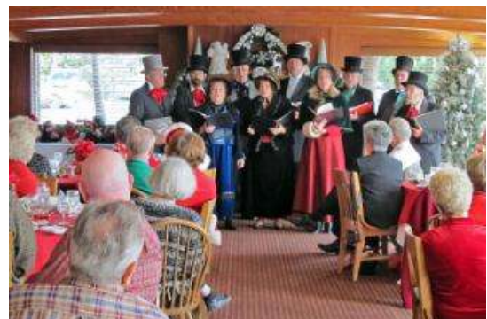
Members enjoy singers at RGC holiday party.