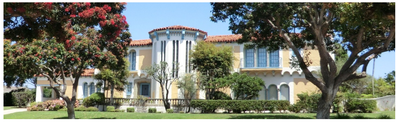
Reid-Rice Home (Hospitality House)