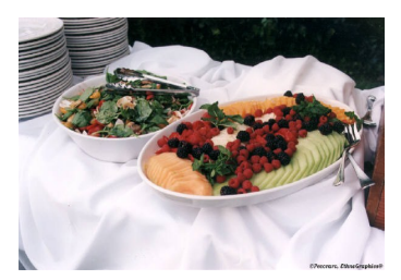
Since 2009 the Riviera Garden Club has held their initial meeting with a potluck luncheon! What a great tradition!