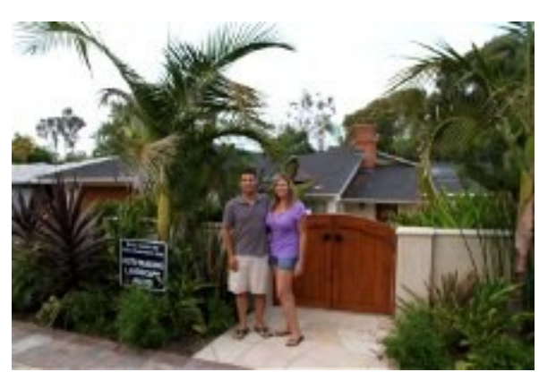
April 2012 —The Kenneth Residence—148 Vista del Parque A wooden gate, palms, and a privacy wall preview a Mediterranean landscape, offering a glimpse of paradise.