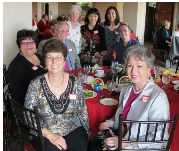
Table at Holiday Party