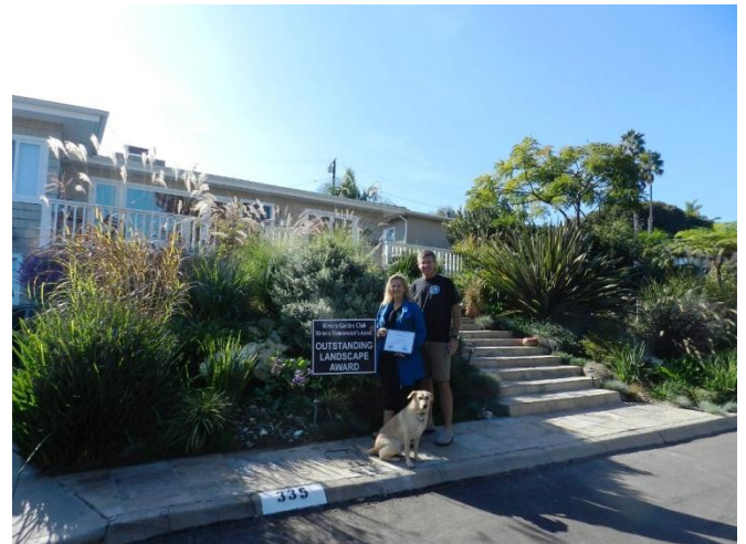
December 2014 – The Pogue residence – 335 Via Linda Vista

John LaCorte's water wise garden features a mature Valencia orange tree in the courtyard. In front of that are cacti, a blooming yucca, colorful Haemodoraceae (kangaroo paws) and contrasting types of mulch all on a drip irrigation system.